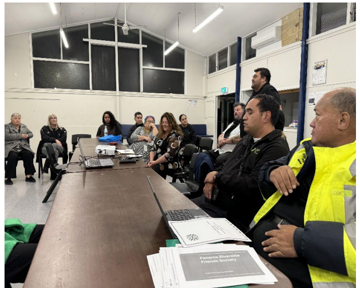
A clear pathway with the vision