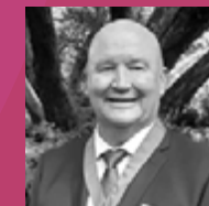
Sir Graham Lowe Patron

Sir Graham Lowe has forged a reputation that transcends his position as a football coach and rugby league icon. From a sport which places a premium on macho image and physical rather than emotional prowess, Graham has moved beyond traditional masculine boundaries to appeal to a broad cross-section of New Zealand society, well outside the game of rugby league.